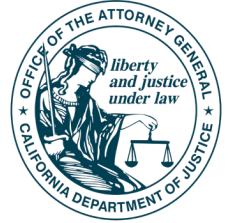
ROB BONTA ATTORNEY GENERAL